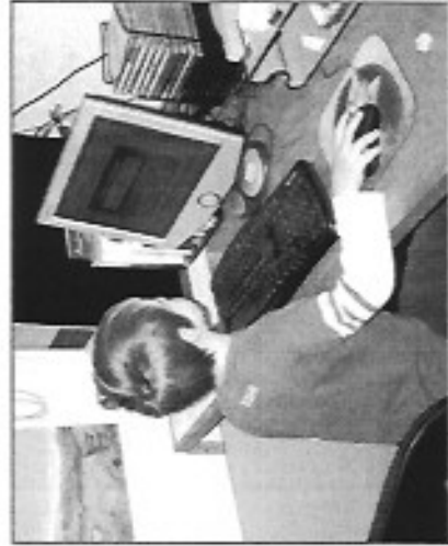
What kind of world will he live in?

She brings to her sessions a lively spirit and a sincere concern with getting things right in what she teaches as well as relating to participants and their needs as effectively as possible.